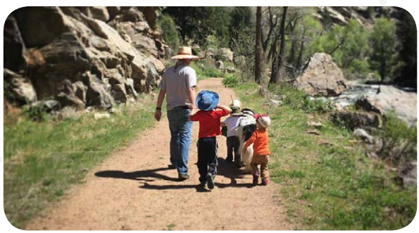
Family exploring a trail