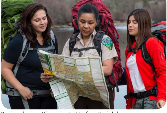
Backpackers getting oriented before their hike