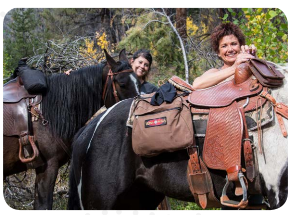
Enjoying a guided horseback riding opportunity